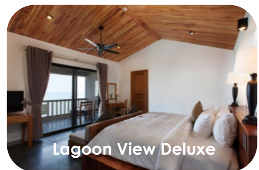
Lagoon View Deluxe